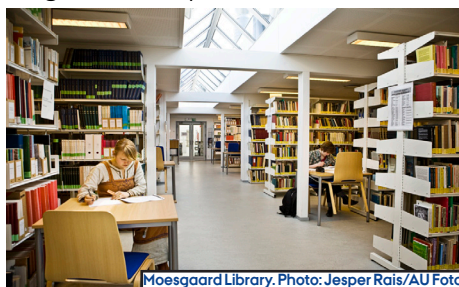
Moesgaard Library.