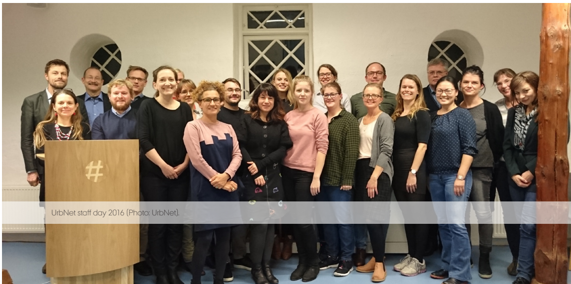
UrbNet staff day 2016 (Photo: UrbNet).

UrbNet is based at Moesgaard - a charming manor from the 1700s, in the middle of the forest and close to the beach. In February 2016, the centre took over a refurbished floor in the same building as the Moesgaard library.